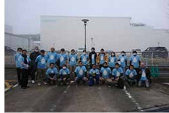
Ujigawa Plant employees help clean up around the factory