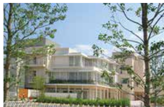
Domyoji-Takadonoen, a general-purpose welfare facility