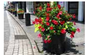
Red Flower Planting Project

Suntory Flowers is providing flowers for areas such as parks to allow even more people to experience a life in a community with flowers. The Red Flower Project has expanded throughout Japan since 2012 to play a role in revitalizing communities by planting flowers in parks and public facilities in each area of Japan under the slogan, "Revitalizing Japan with Red Flowers!" We donated Surfinia Red flowers to organization in each community in Japan. From 2015, we have expanded the scope of our activities even further to engage in "Big Flower Project." In addition, we will continue our activities from 2019 to make as many people smile as possible through the power of flowers, focusing on reconstruction assistance in Tohoku and Kumamoto as part of the Tomorrow's Flowers Project.