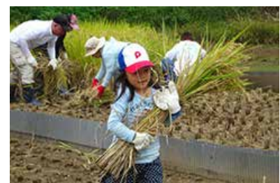
Long Awaited Harvest