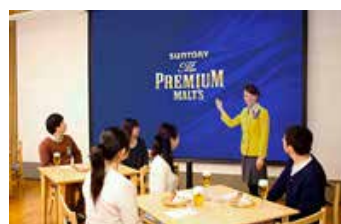
Special seminar held at a beer plant