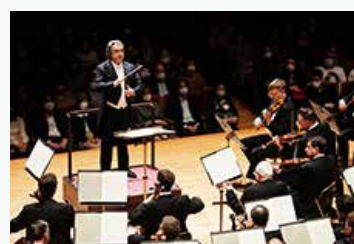
WIENER PHILHARMONIKER WEEK IN JAPAN 2021 Riccardo Muti Conducts WIENER PHILHARMONIKER