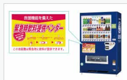
Emergency beverage vending machine

Suntory Foods Ltd. has developed and is furthering the installation of emergency beverage vending machines. This system normally sells beverages from vending machines in peace times but will provide them for free during emergencies such as when disasters strike. Beverages can be easily accessed even if the power goes out. Many people used this system after the Great East Japan Earthquake that struck in March of 2011. We are furthering the installation on premises with focus on public facilities and hospitals. We plan to keep actively installing these types of vending machines in the future.