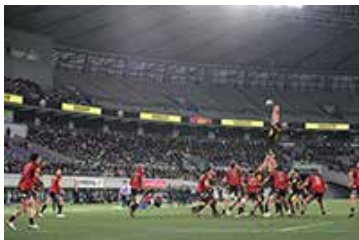
Rugby Team Tokyo Suntory SUNGOLIATH

The Tokyo Suntory SUNGOLIATH team also puts effort into social contribution activities and actively participates in events that include rugby clinics, charity auctions, and disaster recovery support activities.