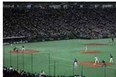
Day of the match (2019)