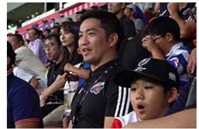
Watching tour of RUGBY WORLD CUP JAPAN 2019 with Suntory SUNGOLIATH