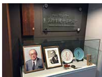
Exhibition displaying the history of the foundation

We engage in research activities for unveiling the mechanisms of life emphasizing molecules using the keywords "metabolism", "biomembrane", and "signalling" by positioning our own research into structural biology, organic chemistry, and molecular biology as points of integration for dissimilar fields. Collaborative research with research institutions such as universities is also promoted. It also operates analysis center to aid research by universities. SUNBOR GRANT for young researchers, SUNBOR SCHOLARSHIP for graduate students, aiding academic meetings, system of postdoctoral fellow, educational support for universities, and other activities to train researchers are also operated.