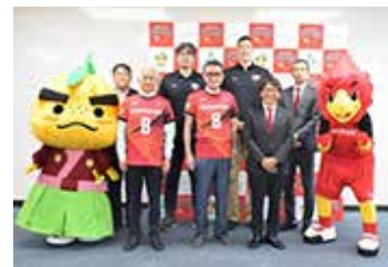
Comprehensive partnership agreement with the home town