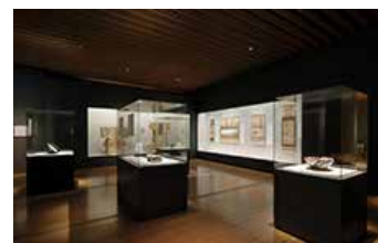
Suntory Museum of Art

Opened in 1961 with the basic philosophy of “Art in Life” , the Suntory Museum of Art has hosted special exhibitions and expanded its collection, mainly consisting of Japanese art pieces. In March 2007, the museum was moved to Tokyo Midtown in Roppongi. Under the theme of “Art Revised, Beauty Revealed,” the museum has held a variety of special exhibitions with approximately 3,000 items from its collection, including one national treasure and 15 important cultural properties, and continues its activities to pass on the aesthetic values that lie at the heart of Japanese people to future generations. The museum, designed around the theme of “Urban Living Room” by architect Kengo Kuma, underwent a major renovation and reopened in 2020. The museum now features a store, a cafe, a tea ceremony room and a hall that features various programs, among others.