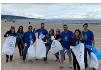
Clean-up at Beam Suntory

Also, coordinators around the world responsible for promoting volunteer activities came together for the Global Volunteer Meeting to study future volunteer activities.