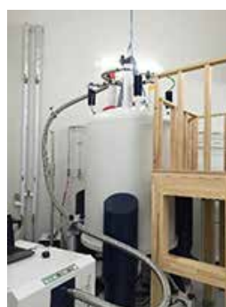
800 MHz superconducting nuclear magnetic resonance equipment

The discovery of enzyme gene for biosynthesis of Sesamolin and Sesaminol from Sesamin, antioxidant components of sesame, has been published for the first time in the world. Also, the gene controlling the contour shape of leaves and the blue formation mechanism created through interaction between flower pigment and flavonoid glycoside are also now known. These and many other research results are published in prominent academic papers. In addition, joint researchers and front-line researchers are invited to hold debriefing sessions annually.