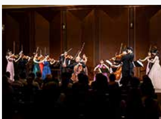
Chamber Music Garden 2021

Suntory Hall has presented unique programs since its opening as an influential venue in the music industry. To commemorate its 35th anniversary in 2021, the hall created a special logo slogan, “The Home of Applause” , and Suntory Hall presented a year-long program of attractive and diverse performances by top artists. Highlights include a specially expanded edition of the annual chamber music festival “Suntory Hall Chamber Music Garden” , the annual “Suntory Hall Summer Festival” of contemporary music, “35th Anniversary Gala Concert” , and the Hall Opera® production of Verdi’s La Traviata. The popular “Wiener Philharmoniker Week in Japan” was led by Maestro Riccardo Muti, which made us re-recognize that sharing music is an essential value for musicians and audiences that brings courage and hope as a new chapter of its history.