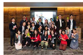
Global Volunteer Meeting