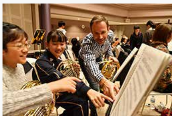
Vienna Philharmonic & Suntory Music Aid Fund: Musical Exchange with the Sendai Junior Orchestra

The Suntory Foundation for the Arts engages in activities with Suntory Holdings Ltd. for the Vienna Philharmonic & Suntory Music Aid Fund for the purpose of invigorating disaster afflicted areas as well as the rest of Japan. We are expanding many of these activities from the Music Aid Award that issues grants to music activities provided together with the Vienna Philharmonic Orchestra to Concerts for Children in disaster-affected areas and mentoring of junior orchestras and musical remembrances.