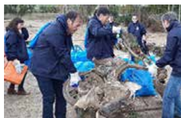
River cleaning at Suntory Beverage & Food Europe