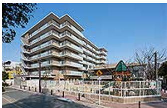
Takadonoen, special care facility for seniors and Tsubomi Nursery School

"Hojukai", the first corporation to conduct social welfare activities in Osaka, celebrates its 100th anniversary in 2021.