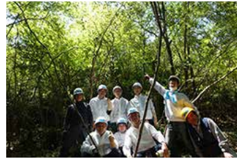
Volunteer Activity at Natural Water Sanctuary Hyogo Nishiwaki Monryuzan