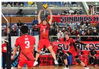
Volleyball Team Suntory SUNBIRDS

SUNBIRDS also actively engages in social contribution activities such as instructing older generations exercise using balls, supporting activities for recovery after the Great East Japan Earthquake, and holding volleyball clinic for elementary and junior high school students at home games.