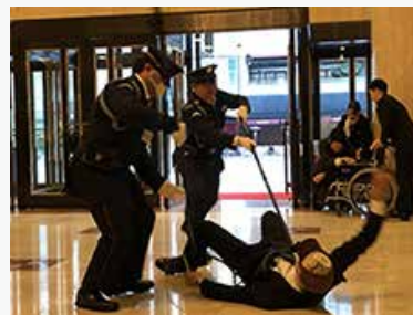
Crime Prevention Drill