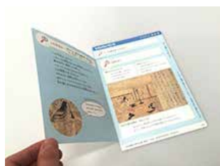
Activity sheet for children

We offer free admission to children in junior high school and younger, and also distribute activity sheets. This tool not only guides users to notable areas of interest but also cultivates a spirit to enjoy free inspiration brought by appreciation. Various learning programs that can be enjoyed by both children and adults are offered at each exhibition. In addition to lectures and workshops, online video streaming is now available as well. Moreover, as a “school program,” we invite children and students in elementary and junior high schools mainly from Minato-ku to visit as well as teach art at those schools.