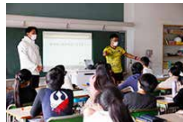
Lecture titled "Trying for Dreams"