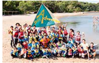
Yoshima Summer Camp

Since 2007, Suntory Group has been promoting Yoshima Project in cooperation with Kobe YMCA, a public interest incorporated foundation which operates a camping site in an uninhabited island in Shodo-gun, Kagawa Prefecture since 1950. The project is intended to nurture spirit of challenge and dreams of children experiencing rich natural environment unique to an uninhabited island and plans and holds Adventure Camp participated by Gota Miura and various programs around the year. Every year, approximately 3,500 children participated in the program. In 2020 there were 250 participants due to restrictions related to Covid-19.