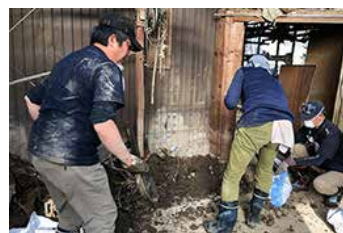
Disaster volunteers in 2018 and 2019