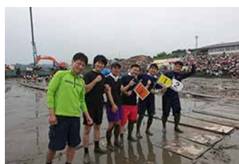
Gatlympics competition volunteers

We work to improve communications with local communities and deepen our understanding of local culture by volunteering to run events for groups that won the Suntory Prize for Community Cultural Activities. (Since 2020, we have suspended our volunteer activities due to the COVID-19 pandemic.)