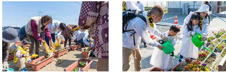
Planting flowers at a temporary housing facility in Kumamoto

This activity was conducted in collaboration with Suntory Flowers as part of the Suntory "Land of Water" Kumamoto Support Project. We delivered flower seedlings to temporary housing facilities in Mashiki, Kashima, and Mifune, three towns near the Kyushu Kumamoto Plant which particularly received extensive damage during the Kumamoto Earthquake, and planted Safinia with local residents.