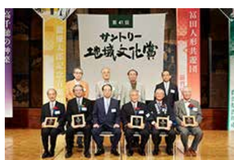
Suntory Prize for Community Cultural Activities award ceremony