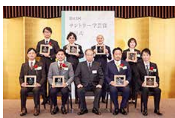
Suntory Prize for Social Sciences and Humanities award ceremony

In recent years, the Foundation has been actively working to provide support to young researches, and carries out initiatives including providing support for human resources who will play a role in the future, providing opportunities for exchange between the worlds of academism and journalism as a bridge between researchers and society.