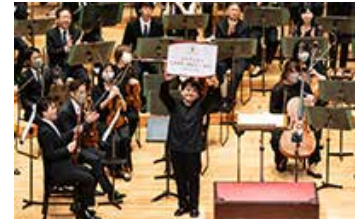
Visitors to Suntory Hall hit 20 million since its opening.