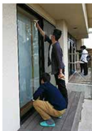
Volunteers busy cleaning windows

Each year Suntory Group employees perform gardening, window cleaning, provide management support for sports events, and other work together with facility staff at elderly care facilities and child daycare centers operated by the social welfare organization Hojukai. Also, new employees of the Suntory Group also participate in volunteer activities such as road cleaning and weed removal after receiving training at each facility regarding the history of the Hojukai and the founders' ideas about social contribution.