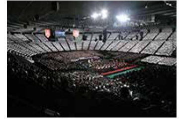
Suntory Presents Beethoven's 9th with a Cast of 10,000

We also undertook a new challenge in 2020 by inviting people from throughout the country to participate by posting singing videos, in 2021, about 15,000 videos from 12 countries made the chorus.