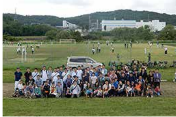
Musashino brewery employees and family members help clean up the banks of the Tama River

The Suntory Group's offices in Japan engage in environmental beautification efforts by cleaning up the vicinity and participating in garbage cleanups organized by local governments. In November 2018, Suntory participated in the Tokyo Bay Cleanup Campaign, which it has been supporting and co-sponsoring from 2003, with employees and 23 family members joining local residents and businesses, and ultimately gathering roughly 170kg of litter. (Since 2020, we have suspended our volunteer activities due to the COVID-19 pandemic.)