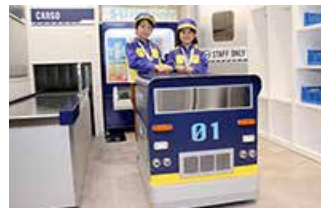
Delivering Products to Vending Machines