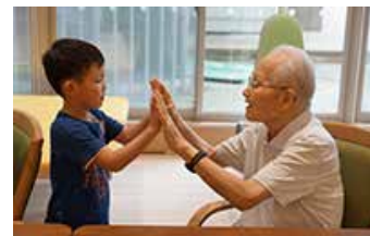
Exchange between Takadonoen and Tsubomi Nursery School