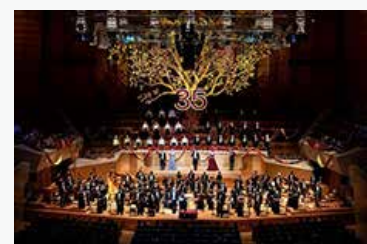
Suntory Hall 35th Anniversary Gala Concert 2021