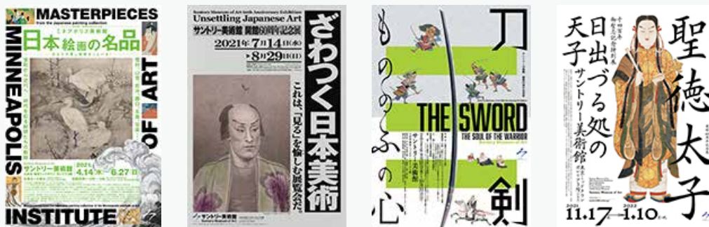
Exhibition poster celebrating the 60th anniversary of the Suntory Museum of Art

In 2021, the Suntory Museum of Art held four exhibitions to commemorate its 60th anniversary. The “Masterpieces from the Japanese Painting Collection of the Minneapolis Institute of Art” exhibition, which featured rare Japanese works of art from the Minneapolis Institute of Arts in the Midwest in the United States, was well received as a traveling exhibition showcasing huge collection of artworks at a time when travel was difficult. This was followed by the “Unsettling Japanese Art” exhibition which drew attention for its innovative approach to stimulate the minds of audiences; the museum’s first sword exhibition “Swords: The Heart of a Mononofu” which was also highly acclaimed by sword fans for its collaboration with popular online games; and the “Special Exhibition Prince Shotoku” that celebrates the 1400th anniversary of the passing of Prince Shotoku, tracing his life and beliefs through various works including original drawings from a popular manga series. Throughout the year, the museum took all necessary measures to prevent the spread of COVID-19 infections, making many guests feel safe and secure during their visit.