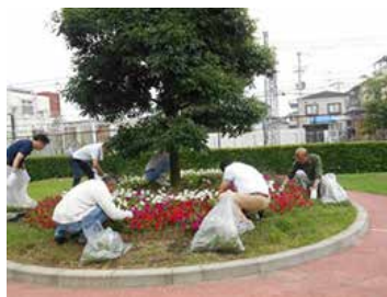
Volunteers at work planting flowers and pulling weeds