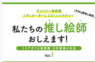
Learning Program:<Video> “Masterpieces from the Japanese Painting Collection of the Minneapolis Institute of Art” We will tell you our favorite artists!

To continuously deliver value to those who may not be able to visit the museum due to the pandemic, we continue our efforts to provide opportunities to experience Japanese culture by offering a wider range of online programs.