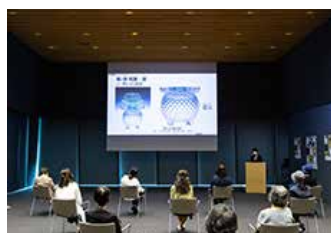
Exhibition guide by educators