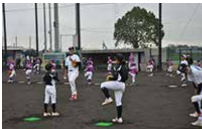
A baseball workshop held in Kumamoto Prefecture in November 2020

Suntory Dream Match is an event held from 1995 where proceeds from the sales of beer and other beverages, baseball goods, charity seats, as well as part of the proceeds from the sales of baseball uniforms signed by participating athletes are used as donations to organize baseball and catch ball classes with the participation of active and retired professional baseball players in order to support the recovery of baseball in the Tohoku region since 2016.