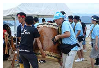
Innoshima Suigun Matsuri operations volunteers