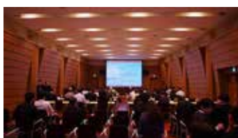
Research Institute Annual Meeting (Saji Keizo Memorial Hall, Osaka University Nakanoshima Center)

The discovery of enzyme gene for biosynthesis of Sesamolin and Sesaminol from Sesamin, antioxidant components of sesame, has been published for the first time in the world. Also, the gene controlling the contour shape of leaves and the blue formation mechanism created through interaction between flower pigment and flavonoid glycoside are also now known. These and many other research results are published in prominent academic papers. In addition, joint researchers and front-line researchers are invited to hold debriefing sessions annually.