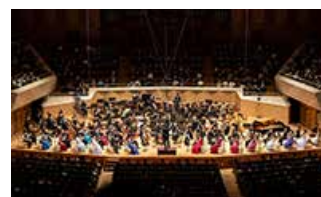
Young musicians passed an audition win an opportunity to perform with Tokyo Symphony Orchestra