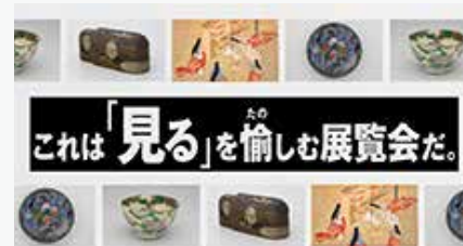
<Video> The exhibition commemorating the 60th anniversary of the Suntory of Art “Unsettling Japanese Art”