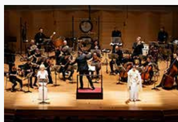
Suntory Hall Summer Festival 2021