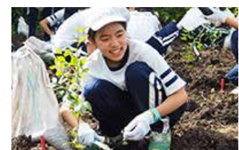
Planting trees at the open air school