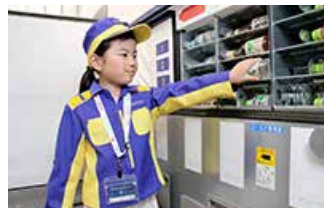
Learning the Inner workings of Vending Machines

The Suntory Group has opened a Beverage Service Center pavilion for children to experience operations related to vending machines at KidZania in Tokyo and Koshien where kids learn about work and society through play. The Beverage Service Center can teach vending machines systems as well as the knowledge and innovations used to deliver products to customers while evoking passion in people to support beauty, safety and reliability. We hope to cultivate work value and bring new awareness to children everyday through hands-on experience where they can interact with actual vending machines often seen as no more than part of the cityscape.