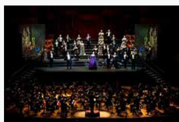
Hall Opera® Verdi: La traviata