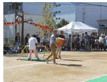
Volunteers at a sports event held at Tsubomi Nursery School