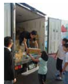
Endowments to inner-city children homes

The Suntory Group has donated approximately 94,000 cases of food and drinks to entities such as orphanages, welfare institutes, community centers, and disaster affected areas since 2010 through the Second Harvest non-profit organization that engages in Food Bank activities. The products that are donated are given under the condition that they have the same quality as the products sold commercially. We also conduct the same level or quality assurance, customer service, and all other operations for those products as the products sold commercially. This program started in Tokyo Metropolitan area in 2010 and was later expanded to include Okinawa in 2013. In the future, we will continue this food bank activity to deliver the appropriate amount of food as necessary.