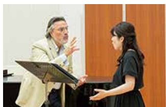
Giuseppe Sabbatini, one of world's acclaimed Tenor, also gives lessons in person as the Executive Faculty of Opera Academy.

Suntory Hall Academy, comprised of the Opera Academy and Chamber Music Academy, is geared towards young musicians who are on their way to becoming professionals. In addition to receiving coaching from the world's leading artists, fellows (academy members) attend regular workshops to deepen their musical knowledge and perform in actual concerts.