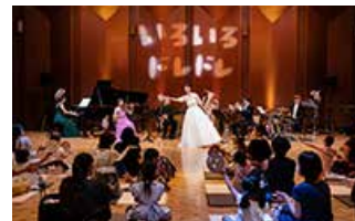
Art Kids Club Iro-Iro Do-Re-Do-Re Suntory Hall and Suntory Museum of Art joint workshop