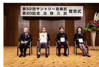
Suntory Music Award and Keizo Saji Prize ceremony

We are involved in a variety of projects designed to promote Western music in Japan, including awarding the Suntory Music Award to individuals and organizations that have made outstanding achievements in the field of music as well as the Keizo Saji Prize awarded for outstanding challenging performances and the Yasushi Akutagawa Suntory Award for Music Composition given to up-and-coming Japanese composers with superior works. We also introduce "Works of Japanese Composers" and provide grants for concerts. Since 2014, Suntory has also been aiming to conserve excellent stringed instrument artifacts which are cultural heritage assets as well as cultivate new musicians through lending activities. The Suntory Foundation for the Arts lends its instruments to junior high and senior high school students and has begun a new program to lend instruments to up-and-coming musicians.