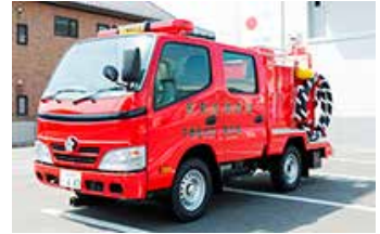
Fire trucks donated to Natori City, Miyagi Prefecture

Although the 2020 event has been cancelled, we have made a donation to Hyogo Prefecture to support medical professionals.