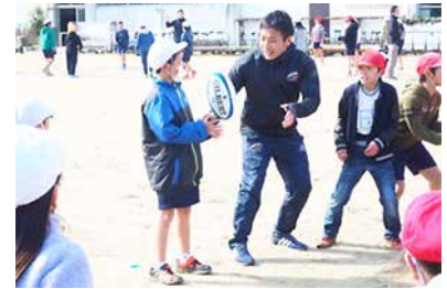
Suntory SUNGOLIATH Rugby Classes