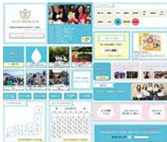
Internal Volunteer information Site Suntory Volunteers

We have worked with NPOs to create a package of programs for The Let's Cut Fabric and Picture Book Delivery international contribution volunteer activities, and posted them on "Suntory Volunteers" so that employees themselves can hold the events at locations of their own choice. Furthermore, we established the Volunteer Leave Program as part of this support system.