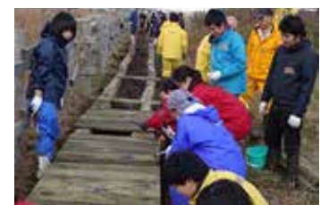
Landscape repair of boardwalk (2014)

Häagen-Dazs Japan has been providing support for the Kiritappu Wetland National Trust in Hamanaka, Akkeshi since 2007 for the Kosen ward of Hokkaido, which is a production area of milk used as an ingredient for ice cream. Kiritappu Wetland has also been registered in Ramsar Convention in 1993 as the third largest wetland in Japan. Our employees are conducting volunteer activities to preserve the scenery of the wetlands by repairing the boardwalk together with the local people every year in addition to providing financial support. These volunteer activities are planned to be continued every year with 2018 being the 12th year of these activities.