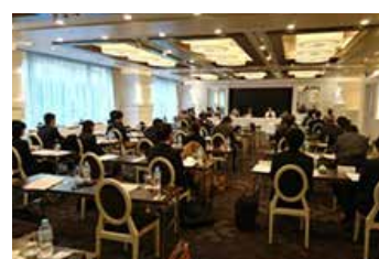
Grant for Groundbreaking Young Researchers report briefing