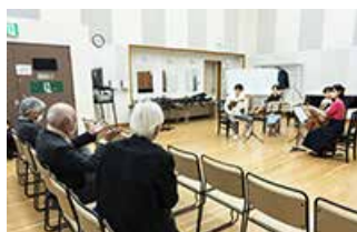
Some alumni and fellows of Chamber Music Academy won international competitions and broaden their career internationally.