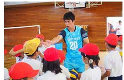
Suntory SUNBIRDS Volleyball Classes