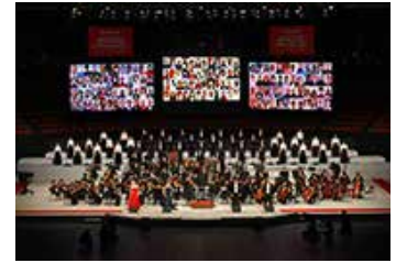
10,000 Choirs online to participate The 38th Suntory Presents Beethoven's 9th (2020)