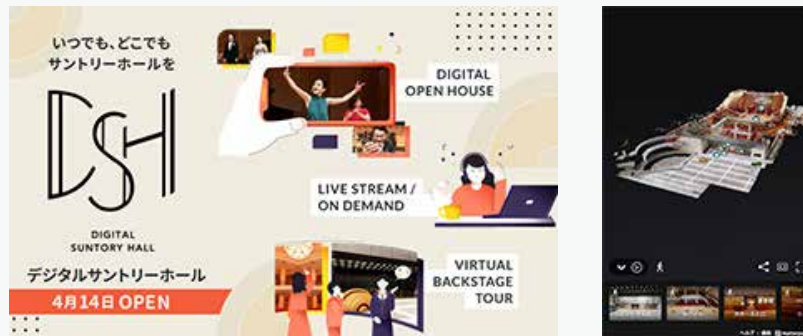
Digital Suntory Hall (DSH)

The aim of Digital Suntory Hall is to deliver music safely and securely both during and after the pandemic, and it hopes that people from all over the world can enjoy the hall’s facilities and concerts regardless of distance, time difference, borders, or language. Currently the contents include Online Events, Virtual Backstage Tour, Streamed Concerts, Online Shop, Video Library, and Performance Archive. All content and information are accessible in English.