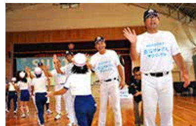
Catch ball class in disaster affected areas using charity