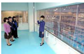
Natural mineral water plant tour

We offer plant tours of our breweries, whisky distilleries, wineries, and natural mineral water plants so that more people can become familiar with our dedication to good taste and safety, our concern for the environment, and the approaches we take through our products. While viewing our production processes, visitors will be provided with easy to understand explanations about the detail that goes into our work and enjoy tasting and other activities. In addition, special seminars to learn the commitment toward brewing beer and ways to enjoy whisky are held, attracting approximately 660,000 visitors each year.