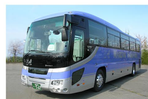
Free shuttle bus

After exiting the station by the stairs/lift, turn left. Buses depart from the furthest bus stop ahead, on scheduled timings.