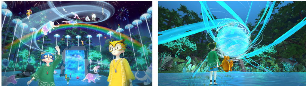
This high-resolution image has been posted on https://www.suntory.com/news/index.html

The Virtual site provides contents that allow visitors in the virtual space to experience the world of A Spectacle of Air and Water “Under the Midnight Rainbow,” which will be held at the Expo. Underneath the enchanting scenery of a rainbow on a moonlit night, visitors will experience the world of the show more profoundly by joining Ao, the main character, and her sidekick Dodo, the spirit of air and water, in taking part in a festival inhabited with wondrous living creatures. Not only will the site recreate the production of the actual show in virtual reality, but it will also incorporate interactive elements that enable visitors to participate in the story. As visitors further immerse themselves in the experience of being an island resident, they will start to gain a greater appreciation for the importance of the bonds between water, air, and life itself.