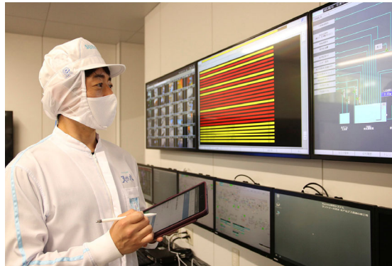
Digital transformation utilizing IoT platform at new factory (A dashboard displaying various information)

Aiming for a next-generation factory model that is overall optimal and continues to evolve by integrating and utilizing factory data